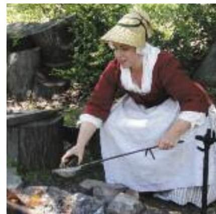
NYS Office of Parks & Recreation & Historic Preservation

Renowned for its curative mineral springs, Saratoga County has attracted tourists since the mid-19th century. Visitors can relax in restored European-style bathhouses once frequented by the nation's elite, and explore the 2,200-acre park's many spas and natural geysers. The park is also home to the Saratoga Performing Arts Center, where the New York City Ballet and Philadelphia Orchestra hold regular outdoor performances during the summer. (518) 584-2535 or www.saratogaspastatepark.org