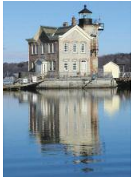
Long a beacon for Hudson riverboats, Saugerties Lighthouse has now become a bed & breakfast.

Completed in 1869 at the mouth of Esopus Creek, the Coast Guard lighthouse was abandoned in 1954 and later restored by the Saugerties Lighthouse Conservancy in 1990. Today, the 46-foot-tall lighthouse is accessible by a one-half mile nature trail; its keeper offers personal tours of the lighthouse and its two guest rooms (if not occupied).