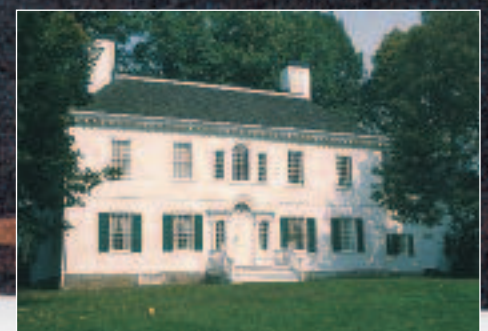
Ford Mansion, military headquarters for George Washington during the winter of 1779 -1780.

Discover the rich heritage that is Morris County, New Jersey. From the Revolutionary history of Washington's Headquarters, to the birthplace of modern day telecommunications, Morris County offers a distinct opportunity to relive our Country's past first-hand.