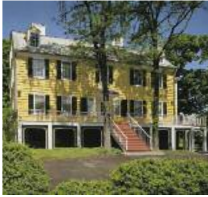
Historic Cherry Hill

Completed in 1813, the nation’s oldest cannon manufactory supplied large-caliber