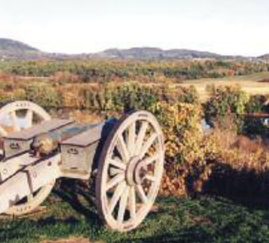
Saratoga National Historical Park

The American victory over Gen. John Burgoyne's British forces at Saratoga in late 1777, marked a crucial turning point in the Revolutionary War.