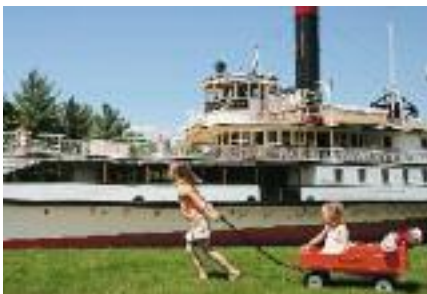
The restored 220-foot steamboat, Ticonderoga, is a highlight of the Shelburne Museum.

More than 150,000 works of art are on display at the 45-acre museum campus, spread throughout 39 exhibition buildings. Twenty-five of the buildings date from the 18th- and 19th-centuries, such as the lighthouse from Colchester Reef on Lake Champlain, Shelburne village distillery, built in 1800 which is now home to the internationally known collection of quilts, and the restored 220-foot steamboat