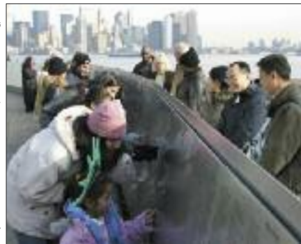
Ellis Island's Wall of Honor® contains the names of more than 700,000 immigrants that came to this country.

Stephen Vail, owner of Speedwell Ironworks, purchased 275 acres here in 1733. Today, seven-and-a-half acres of the mid-19th-century original estate remain and contain a reconstructed factory building, the facility where Vail and Samuel Morse first tested the electric telegraph, a granary featuring exhibits on early farm machinery, and a 1849 carriage house. (973) 285-6550 or www.morrisparks.com