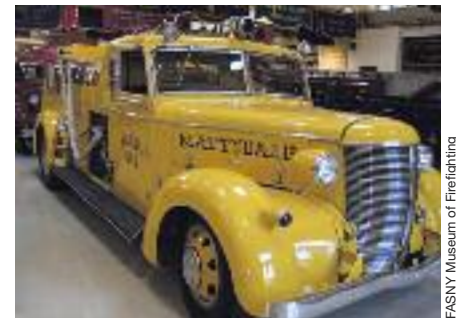
FASNY Museum of Firefighting

Lindenwald, a 36-room, restored Federalist-style house, was home to President Martin Van Buren following his retirement in 1841. Visitors can take a ranger-guided tour through the house museum, which