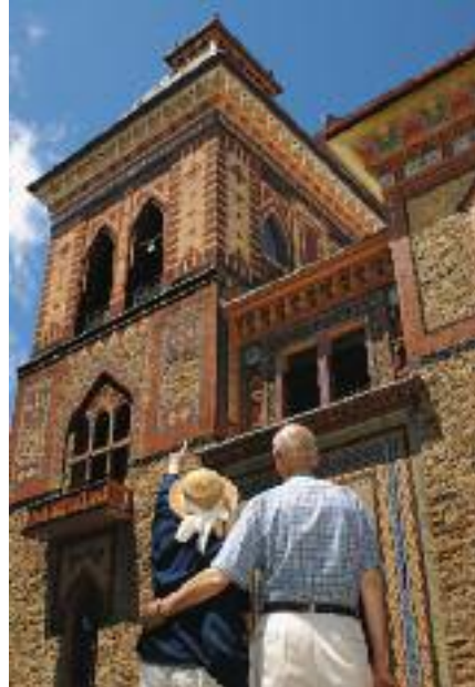
NYS Office of Parks & Recreation & Historic Preservation

This 300-acre site includes Springwood, Roosevelt's life-long home, the first U.S. Presidential Library, a museum, gardens, and trails. The visitors center features a 22-minute introductory video. Ranger-guided tours of the historic home are available. A short bus ride takes visitors to Top Cottage, the home Roosevelt built as a retreat from Springwood. (800) 337-8474 or www.nps.gov/hofr